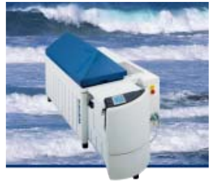
Salt Spray Test Chamber / Corrosion Climate Alternating Test Units

As one of the leading manufacturers of simulation systems worldwide, Weiss Umwelttechnik offers the entire range of high-quality test equipment: from economical series devices to walk-in systems process-integrated systems built to customer specification.