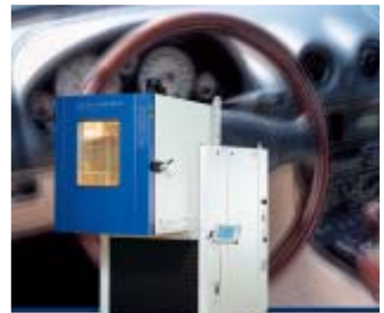
Vibration Test Chamber

A high-performance after-sales service ensures the optimal support for our customers and high operational safety of the systems. Decades of experience in the various fields of application and an intensive exchange of information with our customers throughout the world all serve to guarantee good co-operation.