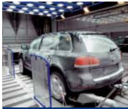
Altitude Temperature Test Chamber with 4-wheel-drive Dynamometer and Sunlight Simulation

A complete product range for temperature and climate testing is available, with test space volumes of approx. 34 litres to 2160 litres and working ranges of -75...+180 °C and 10 ... 98 % r.h.