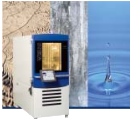
Temperature Test Chambers WT3 and Climate Test Chambers WK3