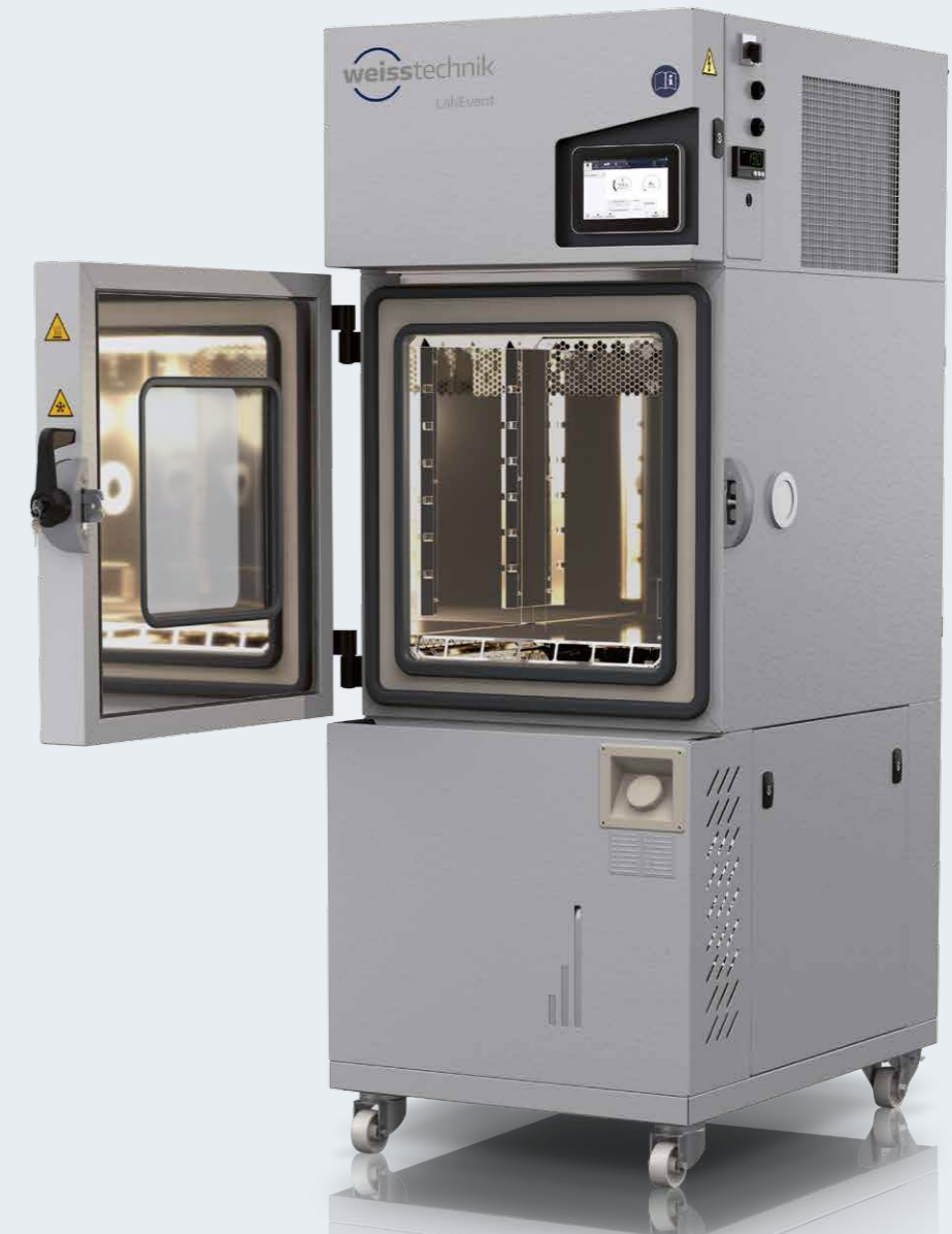
Illustration is similar, contains options

i Our innovative Test Chambers are available as weisstechnik or vötschtechnik .