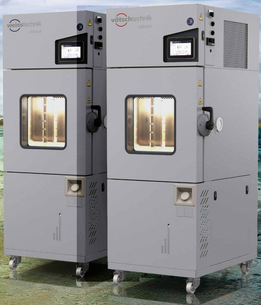
Illustration is similar, contains options