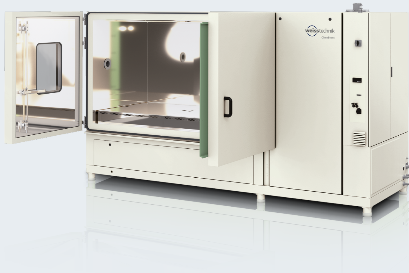
Illustration is similar, contains options

Higher, wider, bigger. Sometimes, it just has to be bigger: in the automotive supply, electrical and electronics industries and in material testing, both large components and complete assemblies are tested. For these tests, we have developed Climate Test Chambers with test spaces that are extra high - the ClimeEvent H series - and extra wide - the ClimeEvent W series - so that your XXL test specimens can easily fit and ease of use is ensured.