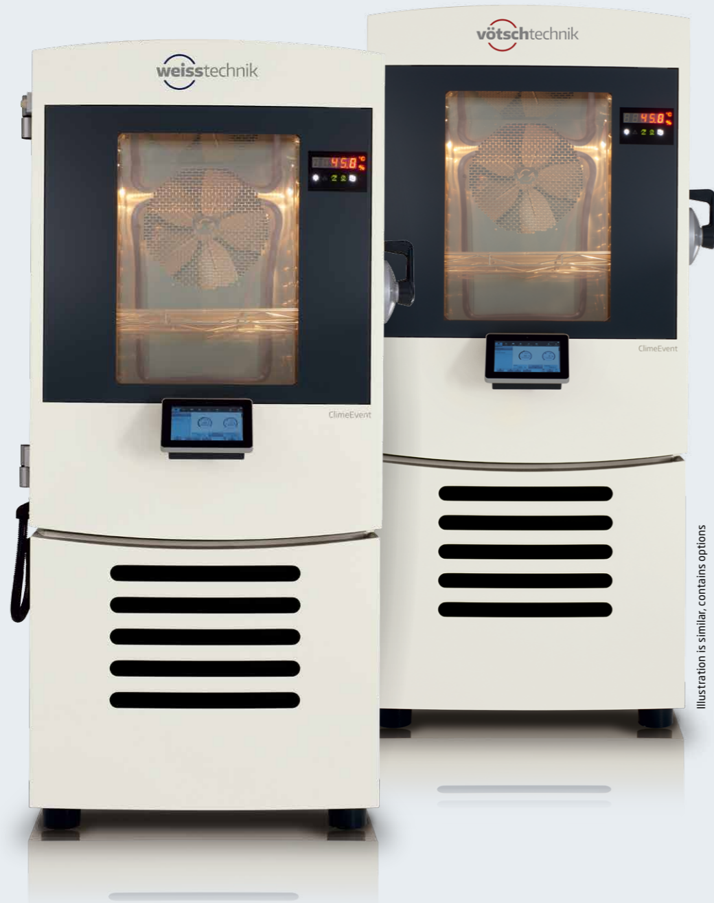
Illustration is similar, contains options

You can find further details on equipment in our technical descriptions. Contact us.