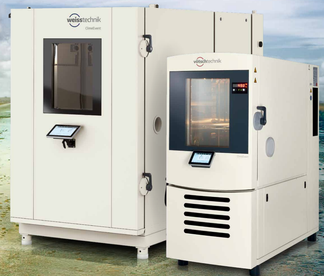
Illustration is similar, contains options