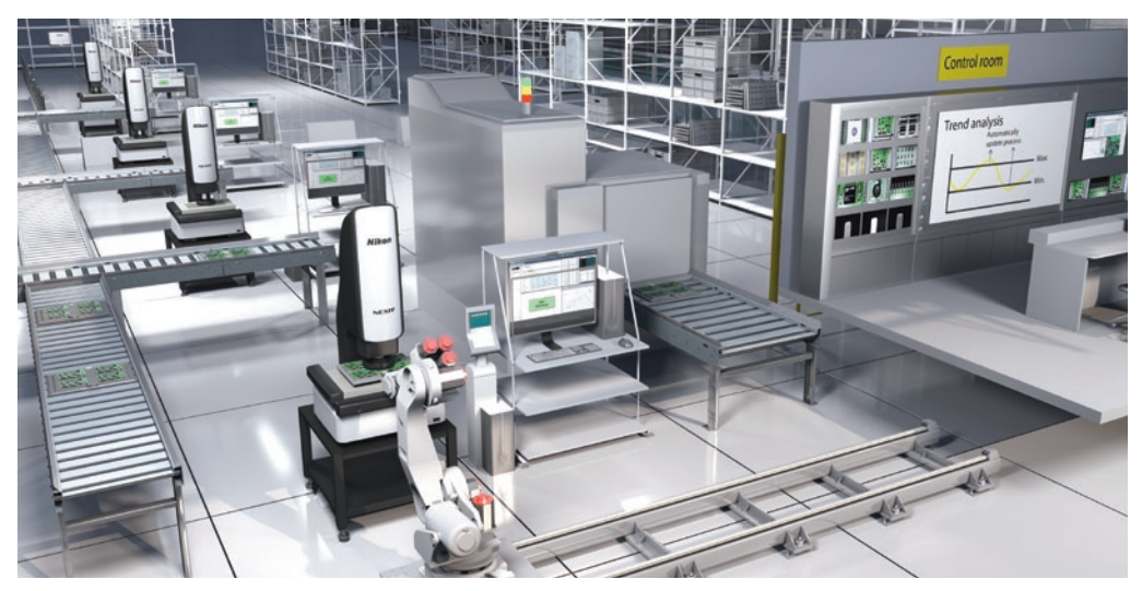
Illustrative example of "NEXIV" operation using "Remote Control SDK". Please take the appropriate safety measures when installing.

Automate component carriers and measurement steps remotely or on the production floor by integrating NEXIV together with the component carrier conveyor system.