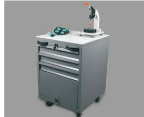
Stand For Levomat