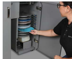
Grinding/Polishing Disc Storage for Automatic Disc Replacement

VELOX 102 is equipped with automatic peristaltic dosing system with 8 peristaltic pumps [ 6 for diamond suspensions/lubricant and 2 for aluminum oxide suspensions]. The automatic peristaltic dosing system is used in combination to obtain consistent specimens and to save time and consumables. Both diamond suspensions/lubricants and aluminum oxide suspensions can be fed. Dispensing parameters like; frequency, fluid selection etc. are controlled through the LCD screen of the VELOX 102. High quality peristaltic pumps guarantee exactly the same dosing every time. Pre-dosing function lubricates the polishing cloth before each operation to increase the life of polishing cloth and obtain perfectly polished specimen surfaces. The suspensions and lubricants that are remained in the dosing tubes retract back at the end of every step to eliminate the risk of contamination from coarse abrasive on a finer grain size with auto retract function. Automatic Liquid Level Calculation of suspensions and lubricants is also available and can be monitored through the LCD screen of the VELOX 102. The calibration can be carried out when a lubricant or suspension is filled. The operator will be informed to refill the bottle when the suspension/lubricant level is below the critical value. All bottles have a magnetic stirrer inside to prevent sedimentation of suspensions and make more homogenous abrasive distribution inside the suspension.