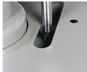
Automatic Dressing Unit

Informs operator about machine status from the long distance.