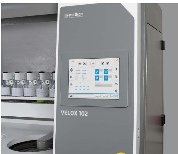
Programmable HMI touch screen controls