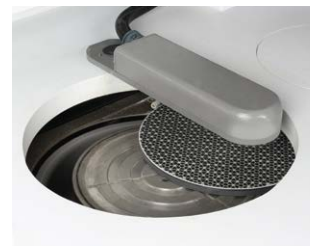
Automatic Disc Replacement Unit