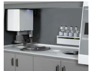
Operator-Free Sample Preparation