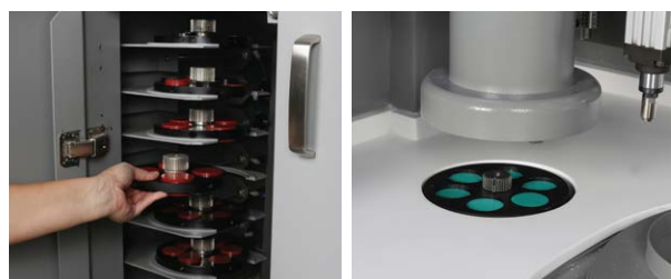
Automatic Sample Holder Feeding Unit